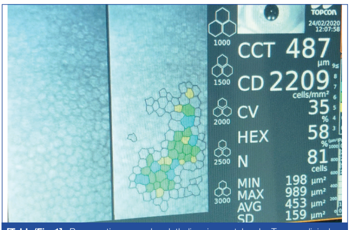
[Table/Fig-1]: Preoperative corneal endothelium image taken by Topcon clinical specular microscope of a 61-year-old diabetic female.

The study included two groups: Group 1 comprised of 50 diabetic patients, who were non insulin dependent type 2 diabetics with good control of blood sugar and Group 2 comprised of 50 non diabetic patients. The participants were selected by convenient sampling after taking written and informed consent. Both groups underwent phacoemulsification using same technique. The details and motive of the study were explained to each patient and after obtaining an informed written consent, they were enrolled in the study. After thorough history taking, general physical examination and local examination were performed including visual acuity with Snellen's vision drum, slit lamp examination, fundus examination and tonometry. Systemic investigations conducted were routine urine examination, complete blood count, fasting and postprandial blood sugar, HbA1c levels, chest X-ray, viral markers such as Human Immunodeficiency Virus (I and II) (HIV), Hepatitis B Virus (HBV), and Hepatitis C Virus (HCV). The CCT and endothelial cell parameters- CD, CV of cell size and Hexagonality of Cells (HC) were measured using Topcon specular microscope by the same observer [Table/Fig-1]. All the patients underwent phacoemulsification using 'stop and chop' technique by a single surgeon. Intraoperative mydriasis, phacoemulsification time and power (EPT) used were noted. Postoperatively CCT, endothelial CD, CV and percentage of hexagonal cells were assessed at week one, week six and three months [Table/Fig-2].